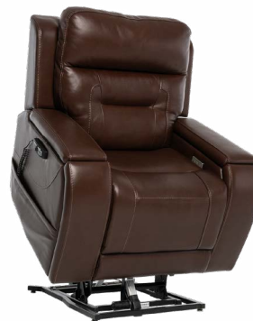
Shown in Sorrento Leather Coffee